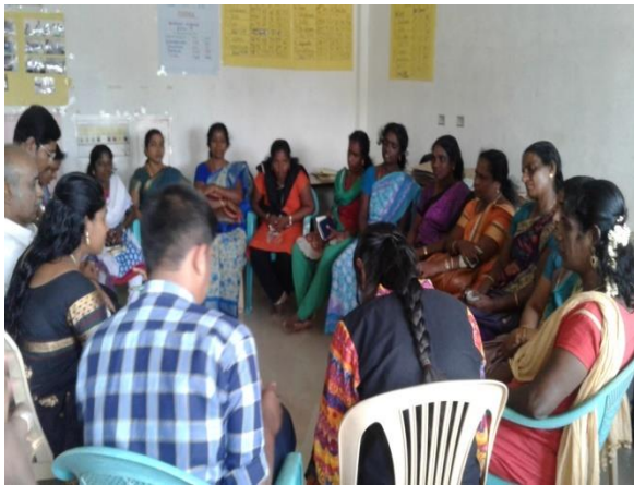
Focus Group discussion