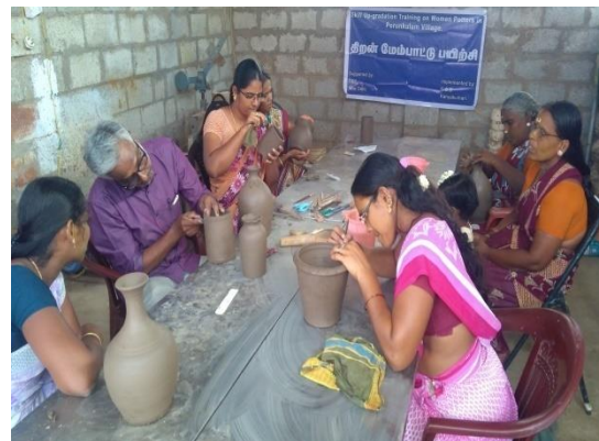
Design Development training