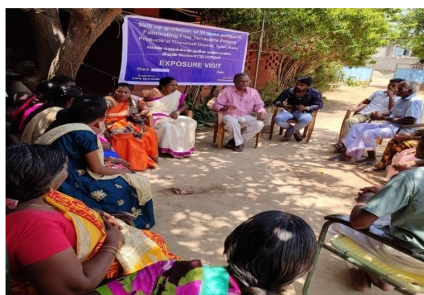
Training inauguration-Mavadi Exposure visit to field station from Melacheval