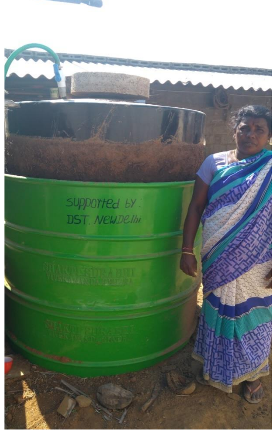
Bio gas plant