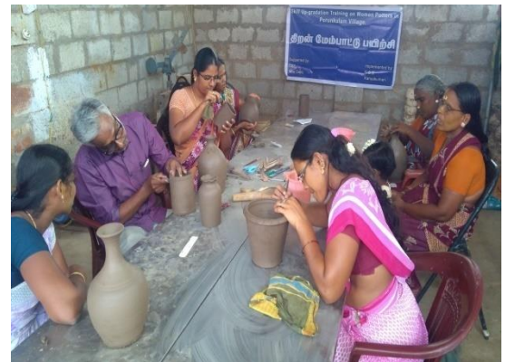
Design Development training