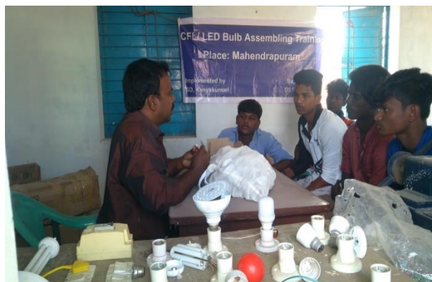
CFL/LED Bulb Manufacturing