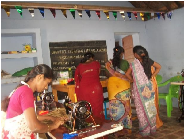
Readymade garment training