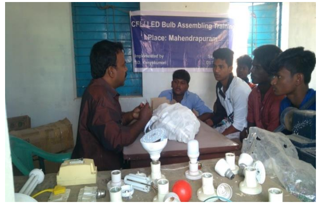
CFL/LED Bulb Manufacturing Training