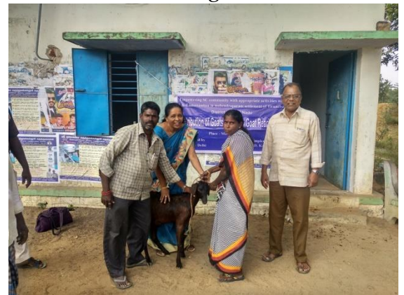
Distribution of Goats