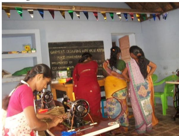
Readymade garment training