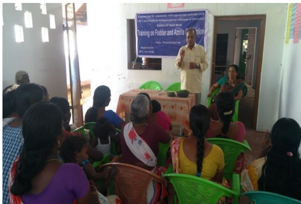
Azolla cultivation Training