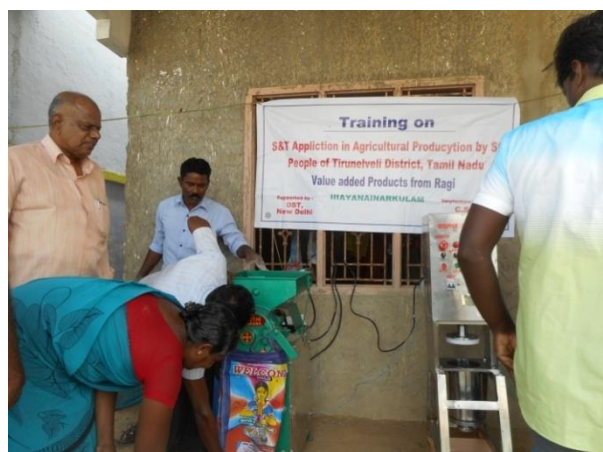
Value added training - Ragi

This program has been sponsored by Department of Science and Technology, New Delhi to encourage the S.C people to create sustainable agriculture in Illayanainarkulam village of Soundrapandiapuram Panchayat of Tirunelveli District. This program was started from 1 st June 2016. Through this project we provided sustainable agriculture to 60 S.C families by providing modern/advanced technologies through training in nursery development, agricultural practices for Horticulture and Floriculture. Under this project, SHGs, farmer club were formed and regular meetings, discussions, conducted to evolve their interest towards S&T application. The project activities have been launched successfully with the help of the community people, local Panchayat members and other Govt. Departments like KVK, Horticulture