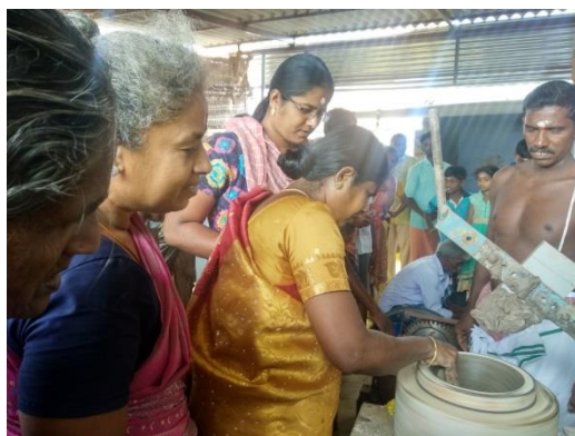
Training on Jigger& Jolly

The beneficiaries of this project are 30 persons selected from Perumkulam village. The project was started from 1 st July 2018 onwards. The first batch training was completed