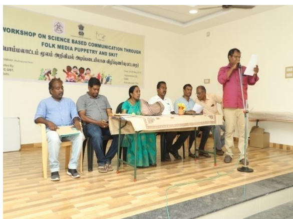
Inauguration of training