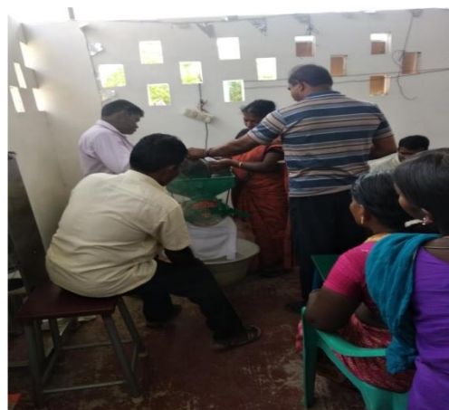
Cattle feed preparation