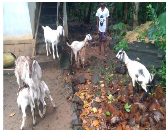
Goat rearing unit