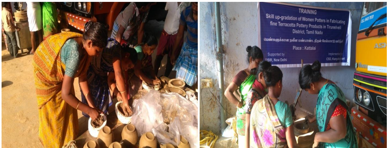
Training on pressing method

For the 2 nd year of implementation we have selected two potters concentration namely Subramaniapuram and Kattalai among the selected potters concentration and training was completed.