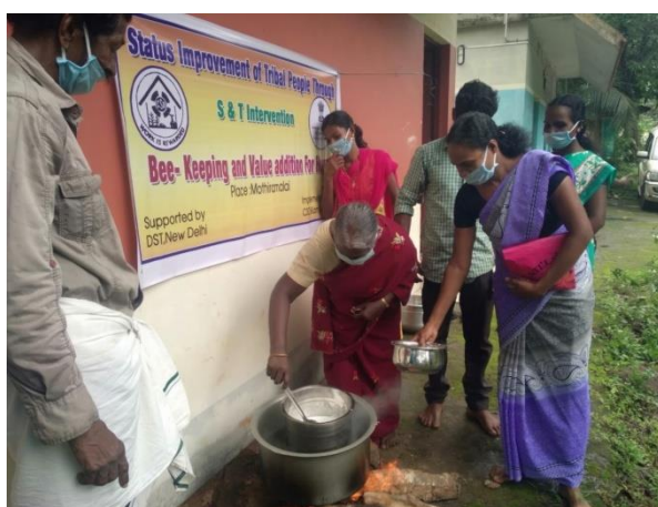
Value added training – Honey