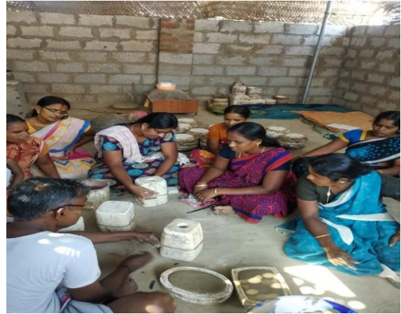
Training on casting method