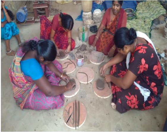
Training on coiling method